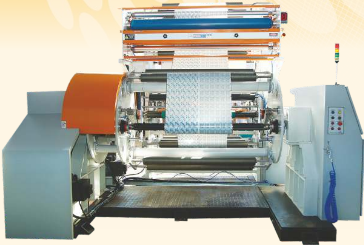
TURRET WITH INTEGRATED SPLICING (Used in converting/offset industry)