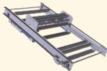
SPLICING WITH BUTT TECHNOLOGY FOR HIGHER GSM (Used in corrugations and cigarette paper industry)