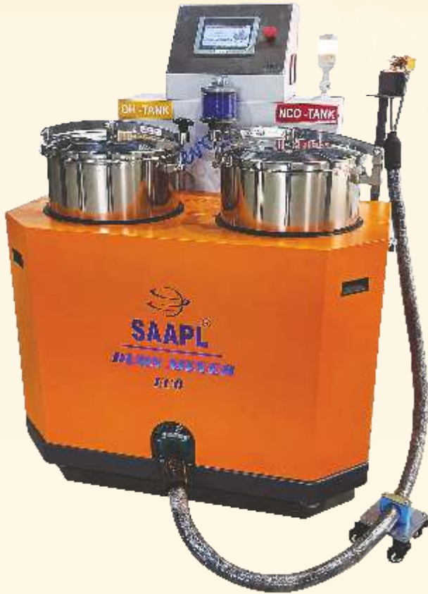
• Duos Mixer Eco