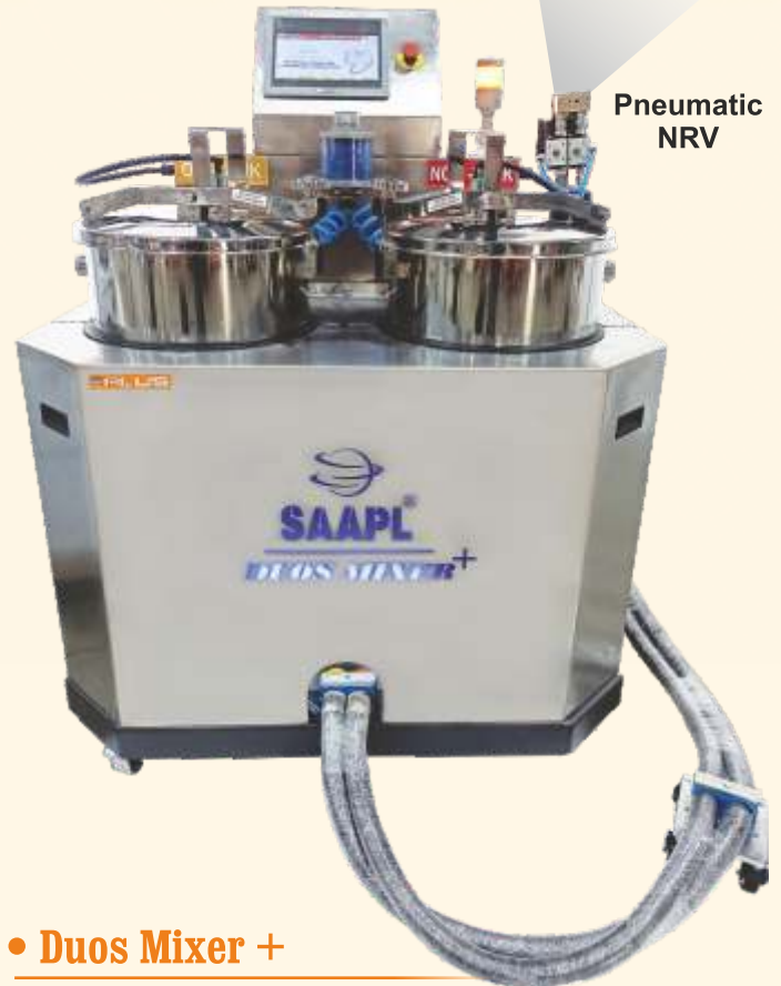
• Duos Mixer +