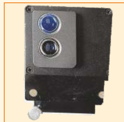
DOUBLE EYE SENSORS