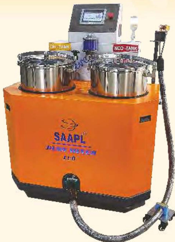
• Duos Mixer Eco